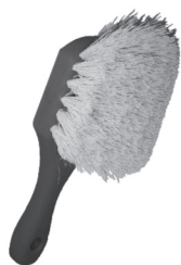
EcoTough Scrubber Brush