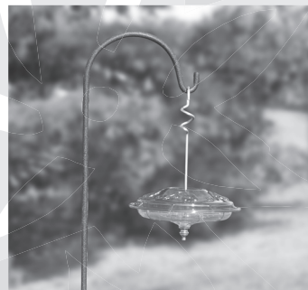
Hummingbird Crook Arm with Feeder