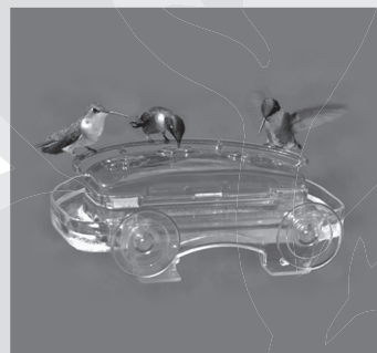
Decorative Window Hummingbird Feeder