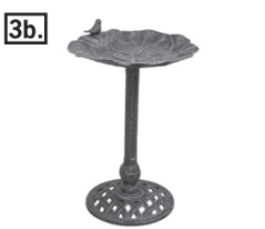
Metal Bird Bath

Regular cleaning will help reduce algae and is good for your birds' health. Scrub your bath regularly with our EcoTough™ Scrubber Brush, rinse well, and replace with fresh water.