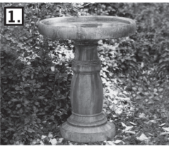
Concrete Bird Bath