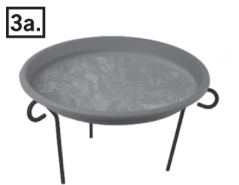
Plastic Bird Bath