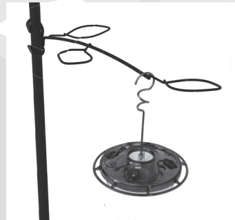
APS Decorative Branch Perch with Hummingbird Feeder