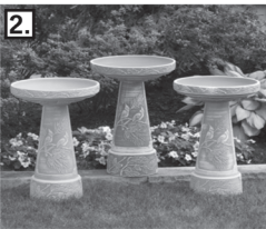
Ceramic Bird Baths